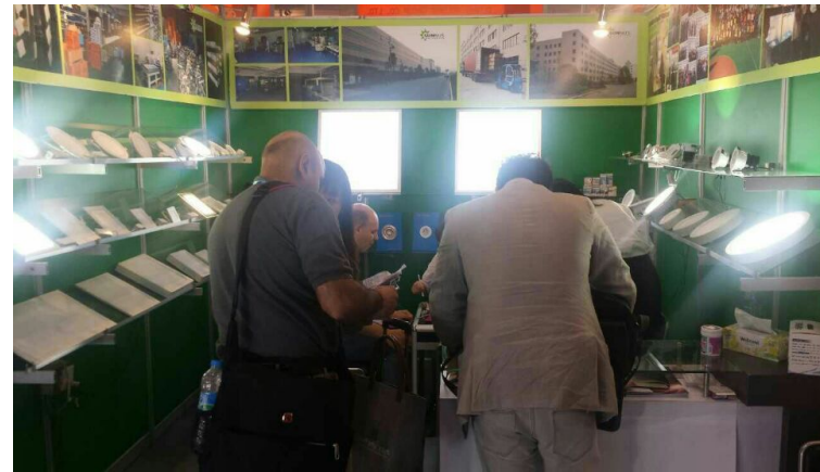
Canton Fair April 2015